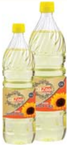
Sunflower Oil 40101

1Lt - 2Lt - 3Lt - 4,5Lt - 5Lt - 10Lt - 18Lt