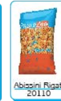
Abissini Rigati 20110