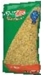
Fine Bulgur 30103