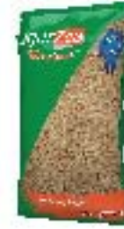
Brown Fine Bulgur 30202