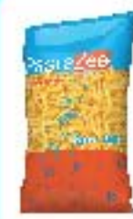
Penne Rigati 2012