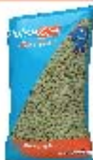
Green Lentils 10401