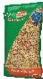
Bulgur Coarse Vermicelli 30104