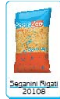
Seganini Rigati 20108