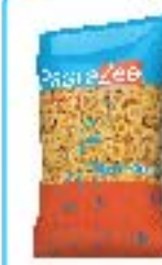
Dischi Volanti 2013