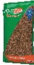
Brown Coarse Bulgur 30201