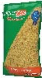
Medium Coarse Bulgur 30102