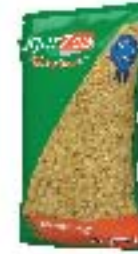
Seferkitel Bulgur 30106