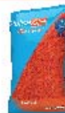
Red Lentils 10301