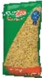
Coarse Bulgur 30101