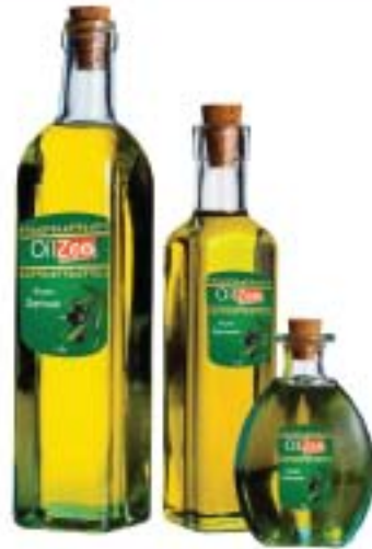
Olive Oil 40201