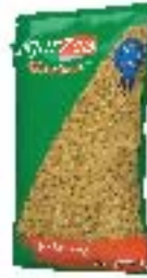
Şişe Çerç Bulgur 30105